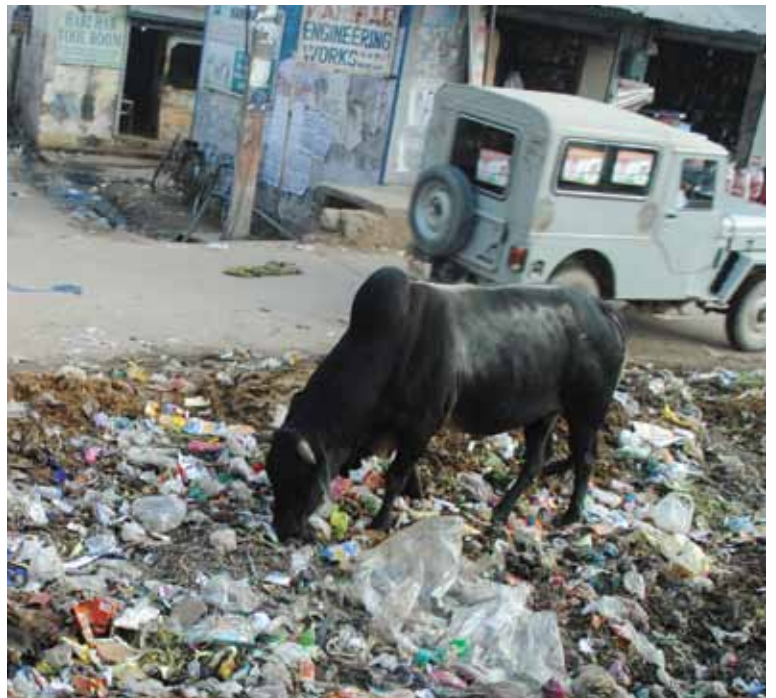
CULTURE OF CONTRASTS.